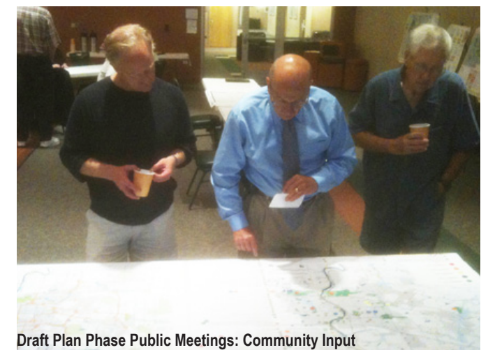
Draft Plan Phase Public Meetings: Community Input