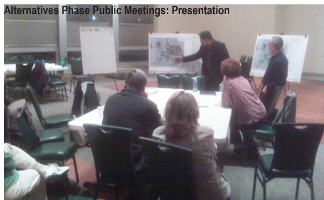
Alternatives Phase Public Meetings: Presentation