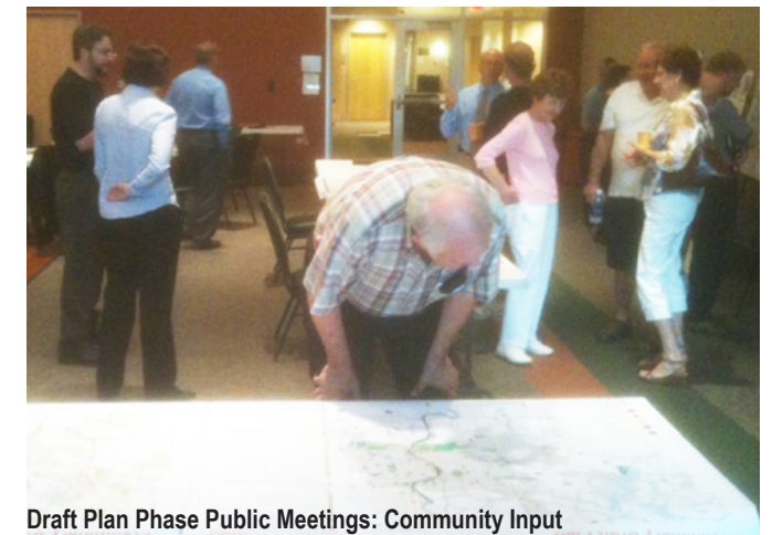
Draft Plan Phase Public Meetings: Community Input