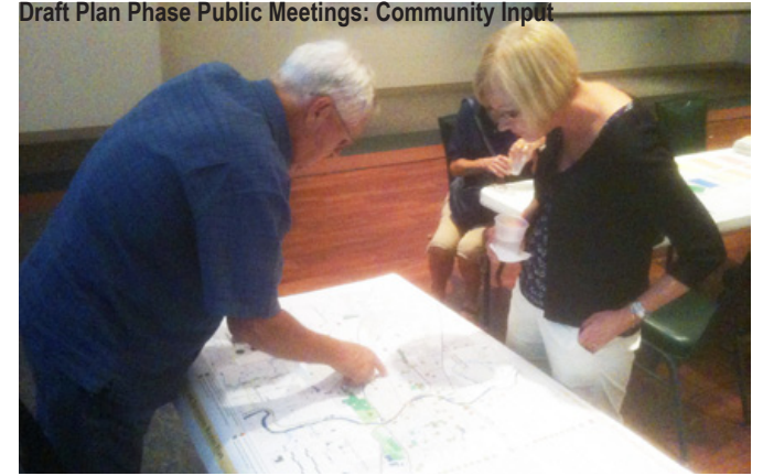
Draft Plan Phase Public Meetings: Community Input