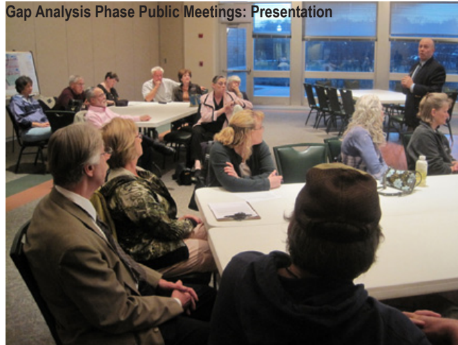
Gap Analysis Phase Public Meetings: Presentation