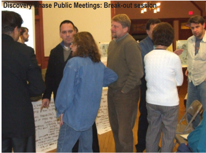
Discovery Phase Public Meetings: Break-out session