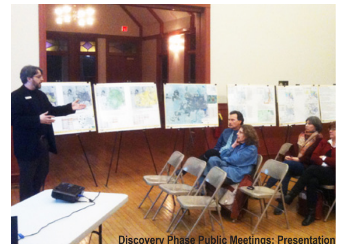
Discovery Phase Public Meetings: Presentation

A summary of the public input process is included in Appendix B.