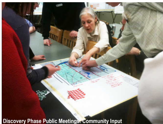
Discovery Phase Public Meetings: Community Input